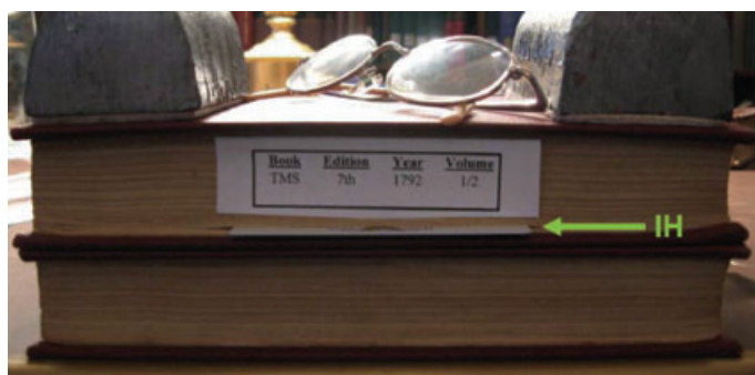
Figure 2: The Theory of Moral Sentiments , '7th edition', 1792

Figure 3 shows a photograph of the 1st edition of WN, 1776. The two volumes of WN 1st edition contain 562 leaves in the